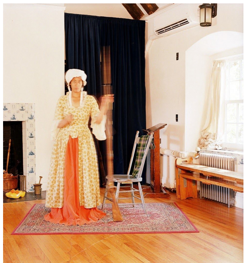
Alicia Grullon, Portrait of a Lady, Traditional C-Print, 13" x 13", 2017

What is a self-portrait? What is a selfie? How are they different?