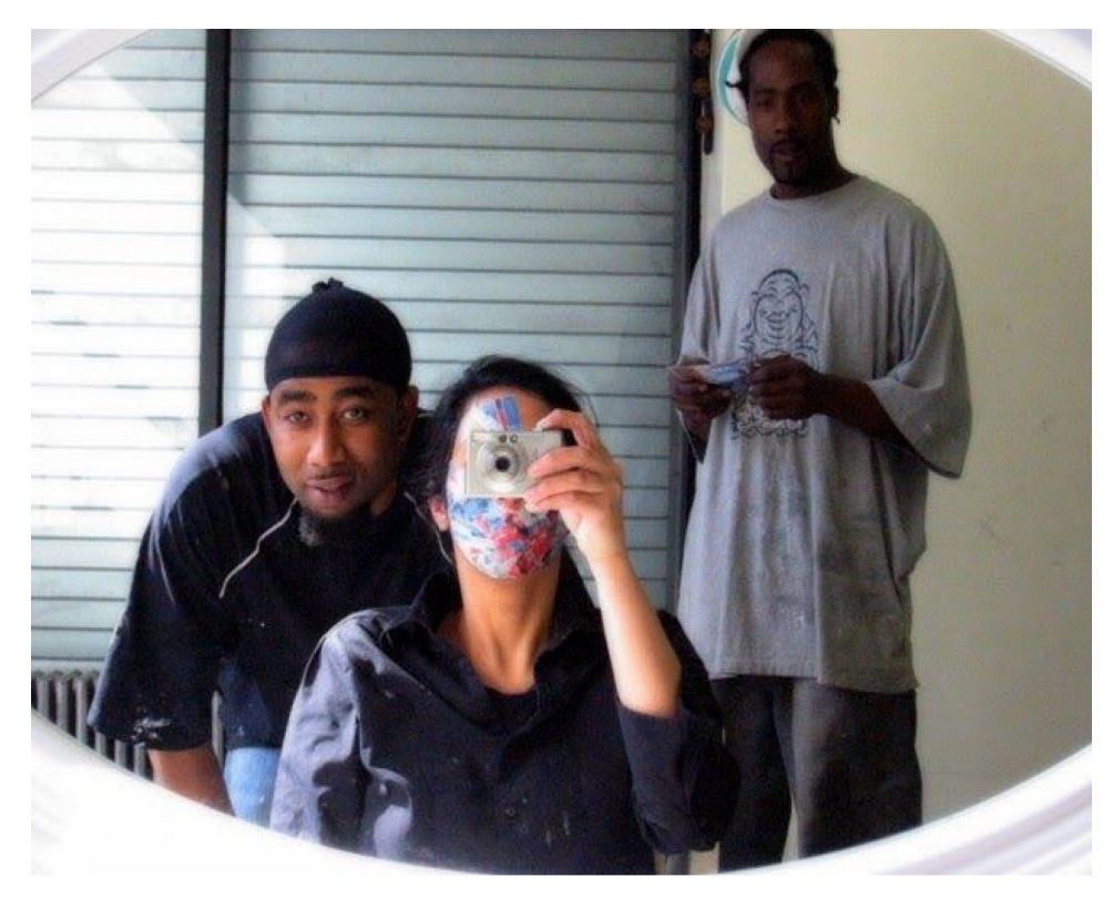
Alicia Grullon, Revealing Ethography: Harlem, Archival digital prints, 4" x 6", 2007