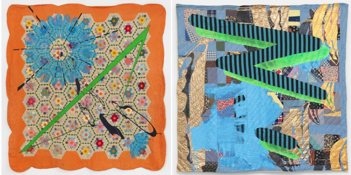
Left: Sanford Biggers, Quilt 14 (Flying Lotus) , 2012. Right: Sanford Biggers, Chorus for Paul Mooney , 2017.

depending on the social context. The Codex series includes mixed media paintings and sculptures done directly on or made from pre-1900 antique quilts. This process, like linguistic code-switching, recognizes language plurality, as the quilts signal their original creator's intent as well as the new layers of meaning given to them through Biggers's artistic intervention.